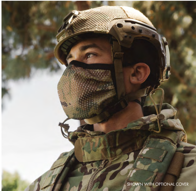
SHOWN WITH OPTIONAL COVER