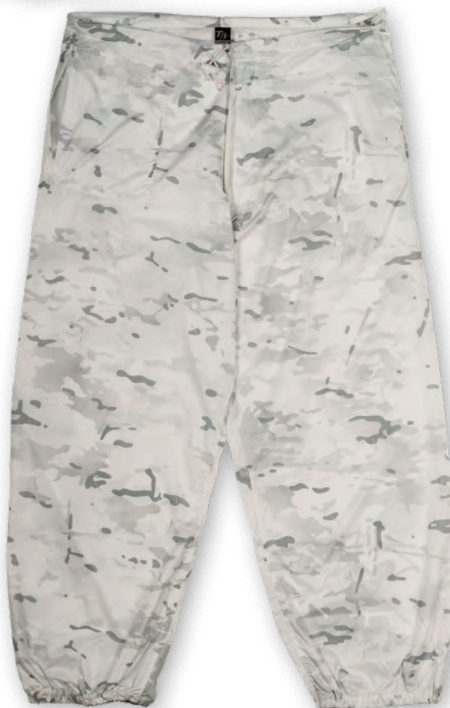
Alpine Camo T3-AOWBOT Solid White T3-OWBOT