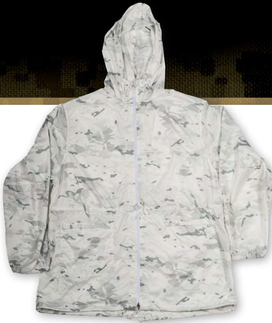
Alpine Camo T3-AOWTOP Solid White T3-OWTOP